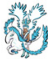
Horse and Knight